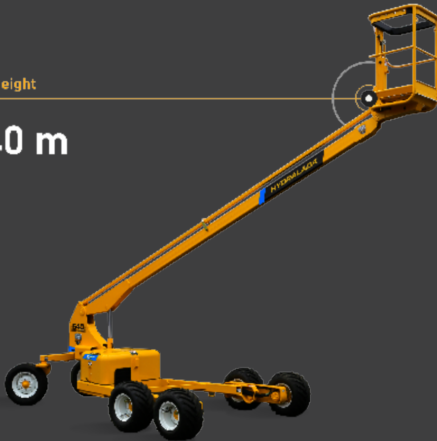
Image shows 640i Model Machine fitted with Tandem Four Wheel Drive and Twin Castor