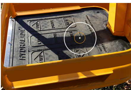
FOOT OPERATED DRIVE CONTROLS